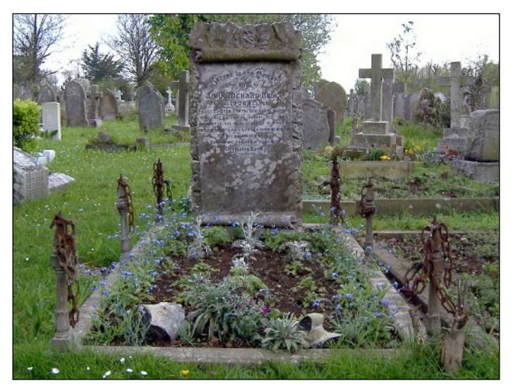
This photograph was taken in May 2006. A corner of the Surfboatmen's grave can just be seen on the left of the photograph