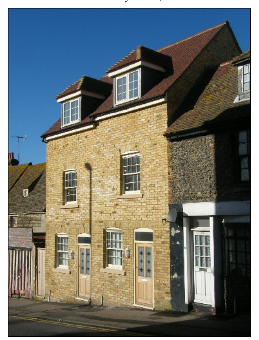
Right: Two houses next to 92 Trinity Square, Margate