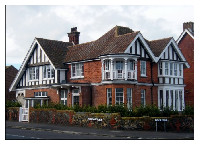
Forest House, 26 Westgate Bay Avenue, Westgate-on-Sea