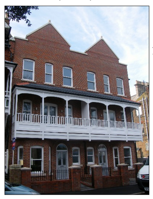
43 & 45 Ethelbert Square, Westgate-on-Sea