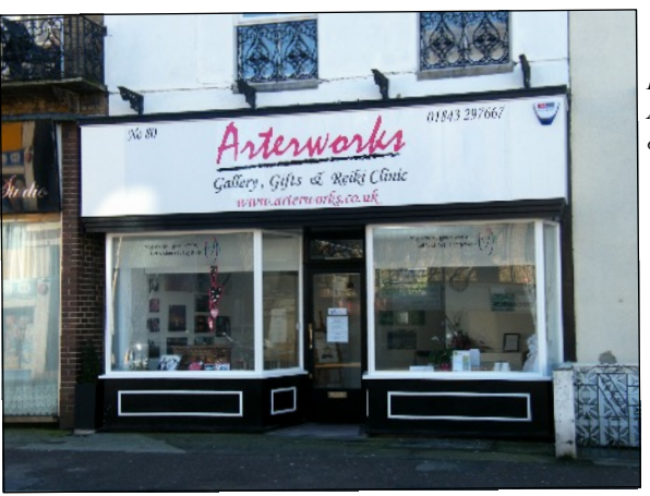
Left: Arterworks Gallery, 80 Northdown Road, Cliftonville