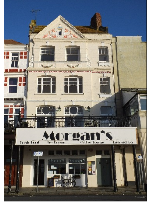
Morgan's Vintage Dance Hall & Coffee Lounge, 46 High Street/18 Marine Drive, Margate

The results of the judging for the Society's 2014 Town Pride Awards will be announced at our meeting to be held on 8th May 2014 when presentations of the Awards will be made to the winners. □