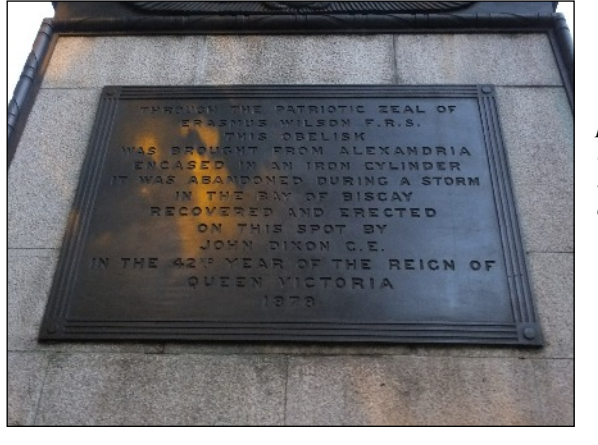
One of the four bronze plaques near the base of the Egyptian obelisk brought from Alexandria and known as 'Cleopatra's Needle'.