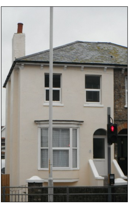
89 Ramsgate Road, Margate