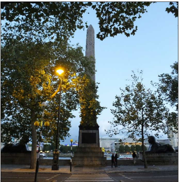
'Cleopatra's Needle' on the Thames Embankment at dusk

The inscription at the base of the memorial showing that it was sculpted by Thomas Brock (later Sir Thomas Brock).