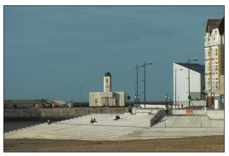
The Steps (Flood Prevention Works), Marine Drive, Margate