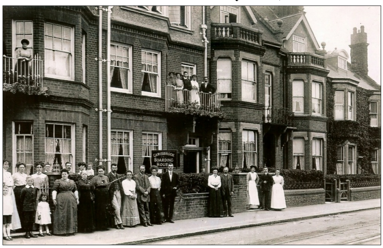
A group of happy visitors pose for a photographer outside Carisbrooke Boarding House, Canterbury Road, Westbrook circa 1910. Note the tramlines in the foreground