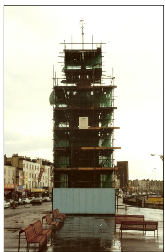
I found this old photograph recently. It was taken on a rainy day in October 1989 - nearly 25 years ago when restoration work was being carried out on the Clock Tower. Note the seating arrangement