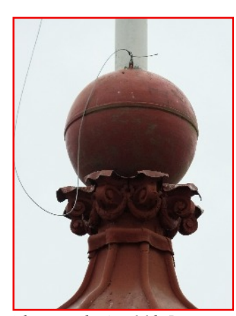
Two close-up photos taken from the 'cherry-picker' on 16th January