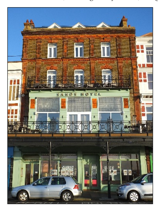
Sands Hotel, 42 High Street/ 15 Marine Drive, Margate