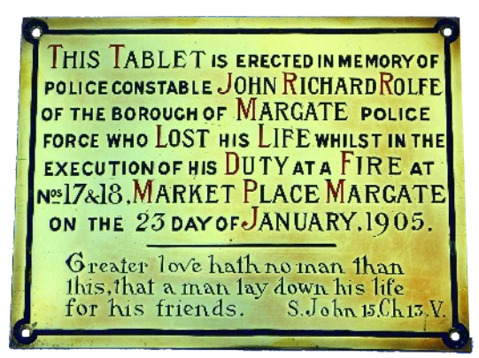
The brass tablet erected in memory of PC Rolfe originally a fixture at the Old Police Station until 1960