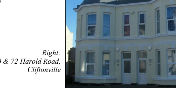
70 & 72 Harold Road,