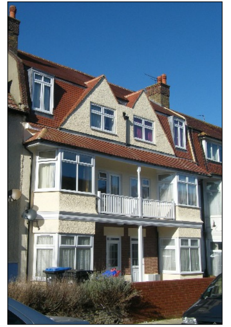
50a & 50 Surrey Road, Cliftonville

This year, the Society received fourteen nominations for Town Pride Awards. All of the properties nominated for the 2014 Town Pride Awards are shown below and on the following page: