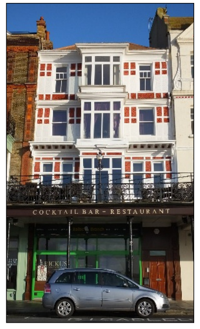
Rickus Restaurant, 44 High Street/ 16 Marine Drive, Margate