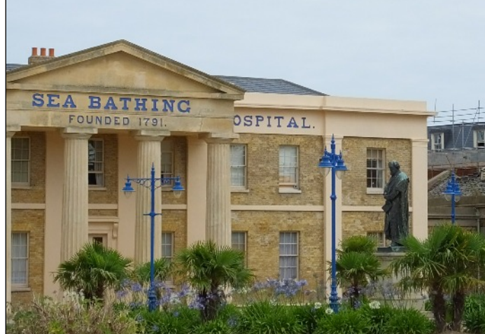
The bronze statue of Sir Erasmus Wilson in the forecourt of the former Royal Sea Bathing Hospital. The sculptor was Sir Thomas Brock