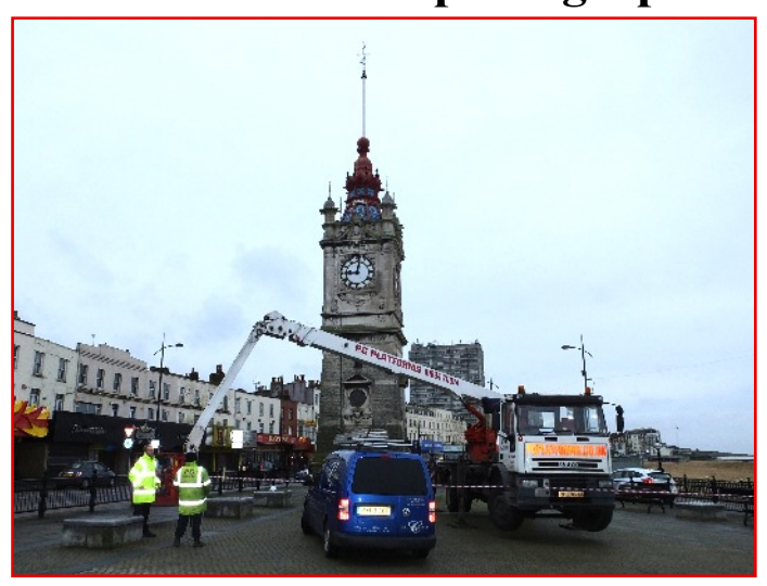
Work starts promptly at 9.00am on 16th January 2014