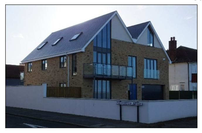
25 Royal Esplanade, Westbrook