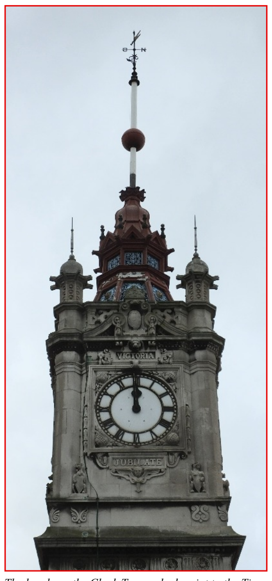
The hands on the Clock Tower clock point to the Time Ball halfway up the pole at mid-day on 16th January