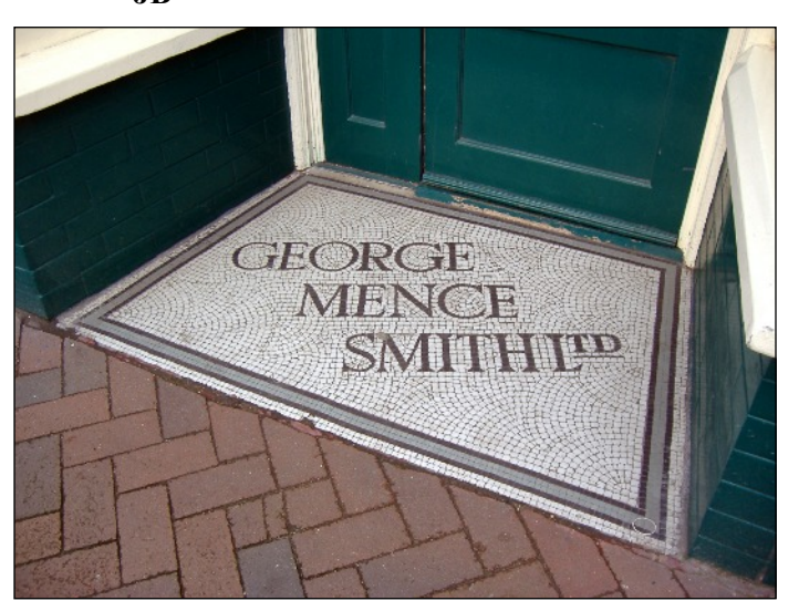
The attractive George Mence Smith Ltd mosaic which still can be seen at the doorway to 17 Market Place