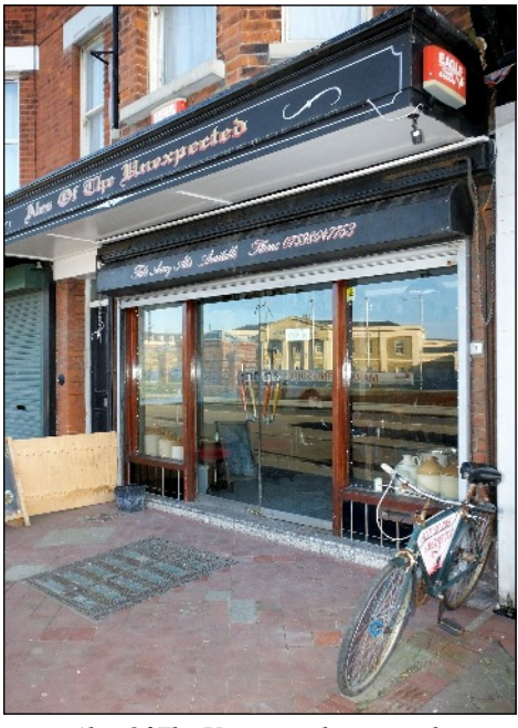
Ales Of The Unexpected micro-pub, 105 Canterbury Road, Westbrook